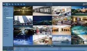
ZKVISION Software(Included in CD)